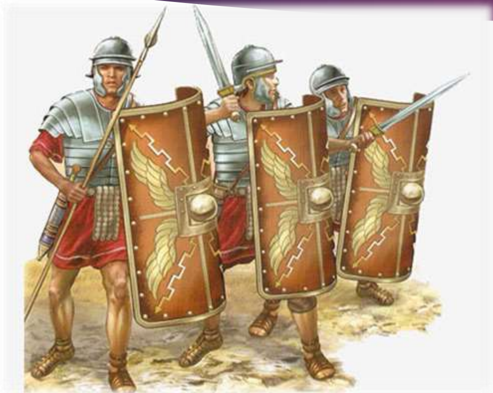
Армия Клавдия II